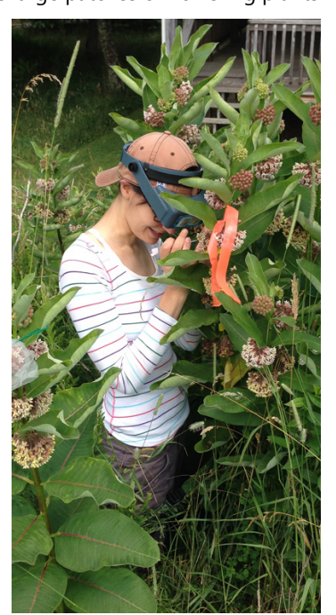
Investigating pollination success at MLBS

in abandoned fields, power cuts and highway margins. Milkweeds are nectar rich and provide food for bees, butterflies and hawkmoths; they also play host to many herbivores, including aphids, beetles, caterpillars and deer. To survive and thrive, milkweeds need to balance strategies to lure in pollinators with strategies to protect themselves from herbivores. The Manson lab, based out of the University of Alberta in Canada, is studying the trade-offs between pollinator attraction and plant defense in milkweeds. Specifically, we are interested in whether well-defended plants are less attractive to pollinators and how this might affect their reproductive success.