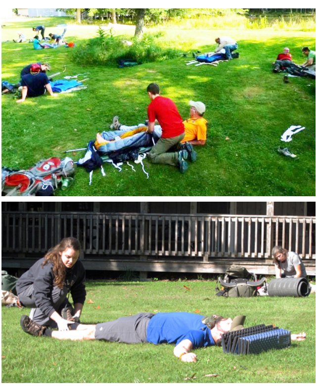
Students practicing wilderness first aid skills in hands-on scenarios

This kind of training is recommended for