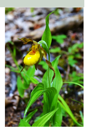
Yellow lady's slipper

Then we put it in an evolutionary and classical framework. When you put it into a deep time frame, and then a classification that reflects that understanding and using the various tools that are available for identifying plant (keys, online tools) then it is like learning how to fish. You can go anywhere in the world and use same observational deductive tools to piece together a region. Once you can start to differentiate the green backdrop and put it into a scheme then you can differentiate how different communities of plants and animals co-occur. There are a tremendous number of community types right in the area, but we also go on field trips.