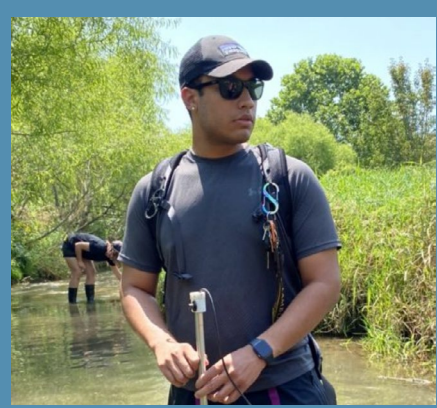
2021 Stream Ecology Class

After our fun filled days of using fancy equipment and taking macro-organism samples, my classmates and I would find new adventures to partake in around the Station. Those adventures would be anything from bon fires and movie nights to hiking or catching newts in the pond. Mountain Lake Biological Station allowed me to immerse myself into the world of a biologist. Being surrounded by people with a passion for biology, I was able to view the science from their perspective. My experience at MLBS is one I will forever cherish; I am so grateful that I was able to interact with people who deepened my passion for biology.