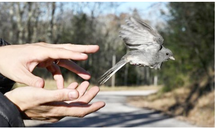
Dark-eyed junco released after banding last season.