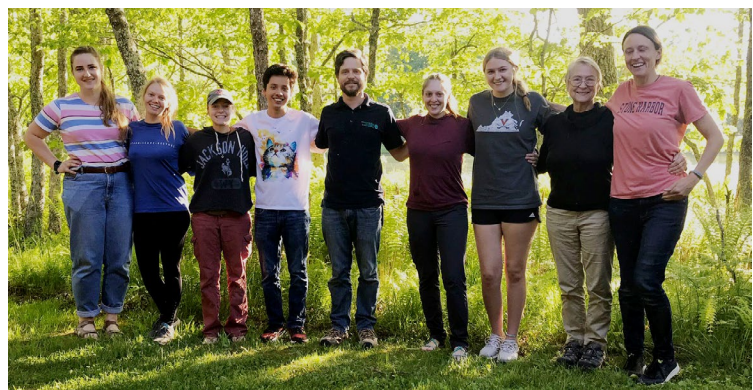
2021 Junco Crew