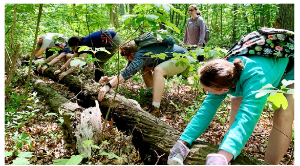
Herpetology students searching for salamanders on a field trip to Maple Flats.

We are open and operating, and feel confident in our procedures and protocols. Still, we understand the world has changed and we are in this for the long haul. Moving forward, we remain committed to safely offering the services, support, programs, and community that make MLBS the special place that it is.