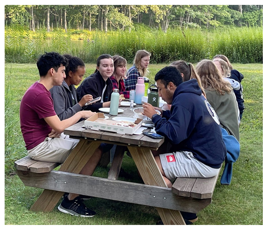
Pizza night out by the pond.