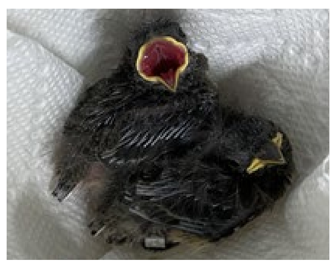
Nestling dark-eyed juncos.

At the end of the summer the experimental juncos were transported from MLBS to Indiana University and are currently free-flying in a large open aviary. But the study will continue. To address migratory timing questions, the second part of this experiment will be conducted in early spring 2022. Gonadal growth, which occurs earlier for non-migrants, will be measured, and trackers will be placed on the juncos to measure migratory restlessness, an indicator of the urge for migration.