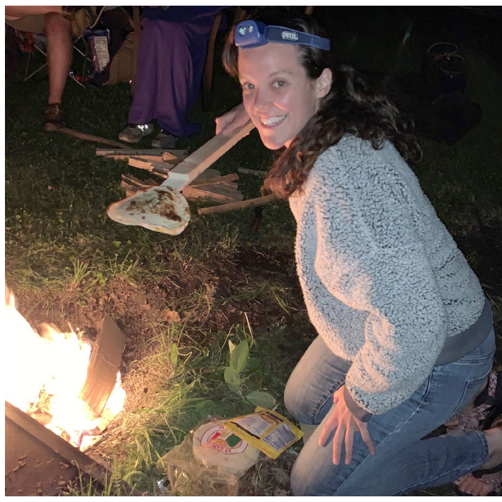
Making quesadillas at the annual pig roast.