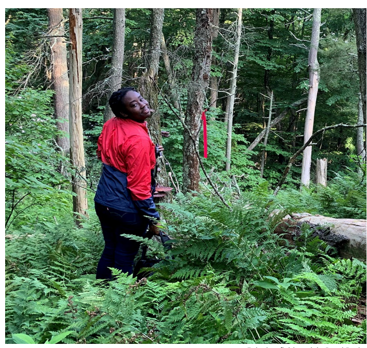
Enjoying field work in Pond Drain.