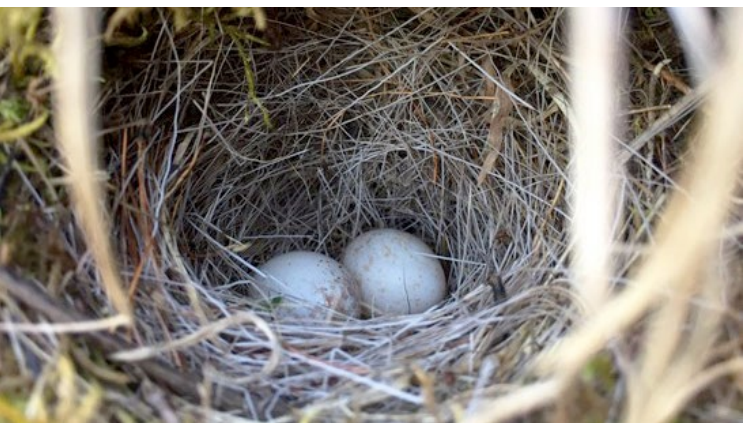
Dark-eyed junco nest at MLBS last season.