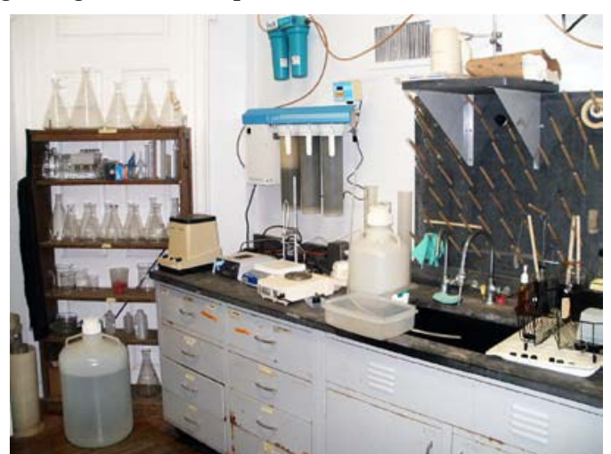
Cramped, out-of-date lab space in Lewis Hall.

research, to a 12-month nationally oriented fullservice field station with a growing outreach compo-