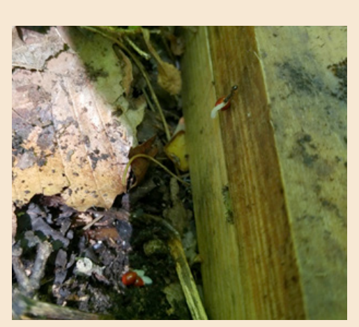
An Aphaenogaster ant disperses a seed into her artificial nest box. Aphaenogaster ants (commonly called the Winnow ant) are the keystone seed dispersing genus of ants in eastern North America. Once in the nest, she will feed the elaiosome to the ant larvae.