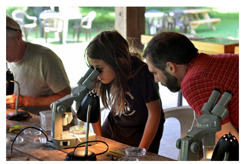
Visitors explore pond life up close

Over 265 guests visited the Station for this year's Open House, making it our largest crowd yet. Visitors of all ages enjoyed a gorgeous afternoon on the mountain learning about our research, interacting with our scientists, and getting up close and personal with our study organisms. Highlights included collecting insects with our entomology class, seeing a variety of snakes in the "snake lab," entering the disease ecology lab through a life-sized Sherman trap, collecting and observing caterpillars and other invertebrates under microscopes, playing "Block the Metapleural Gland on the Ant", learning how we study forked fungus beetles' social lives, seeing a variety of salamander species, hiking with our biologists, experiencing (and creating!) nature-inspired artwork, touring the National Ecological Observatory Network site (with its 96-foot-high tower), exploring the Station's biological collections, learning about the local plants, weeds, and natives, and so much more. We hope to see you all again next summer!