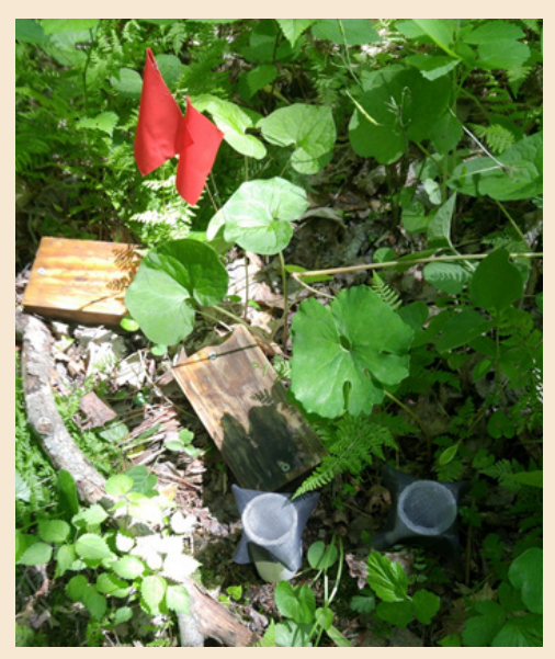
The field set up for the project investigating the effects of ant handling on seed coat microbial communities. The plant by the flags is Sanguinaria canadensis , commonly known as bloodroot. Ants disperse its seeds.