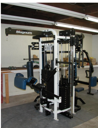
New fitness equipment at the station

Full-Time Station Manager - Full time. Permanent. This position will support the research, educational and outreach activities at the Station. For full announcement http://mlbs.org/node/518 . To apply jobs.virginia.edu/applicants/Central?quickFind=66297