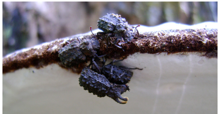
A group of forked fungus beetles ( Bolitotherus cornutus )

The community that I've found at MLBS extends beyond the physical boundaries of the station. Mountain Lake is something of a hub for evolutionary biologists. I've been lucky enough to share my work with internationally renowned biologists that come to the station through the Walton lecture series. At conferences in places as far-flung as Oklahoma, Utah, and Ontario, I've bonded with more people than I can count over our shared experiences at Mountain Lake. I'm determined to seek out similar academic communities as I move onto a post-doc. Mountain Lake has taught me that I'll be a much better scientist for it.