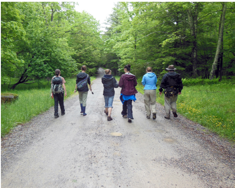
The "Beetle Crew" returns to the station after a day in the field.