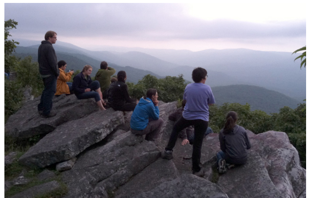
MLBS researchers at the Wind Rock overlook at sunset.