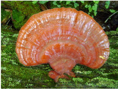
Ganoderma tsugae, a wood-rotting fungus.

Mountain Lake has converted me into a whole-hearted believer in the importance of community in science. I'm indebted to both my mentors and my students for transforming me into a biologist over the seven years I've been at the station. One of the most fulfilling parts of my entire graduate career was mentoring students through NSF's Research Experiences for Undergraduates program at MLBS. My students were a constant source of renewal for my own love of science and their questions pushed me to dig deeply into foundational evolutionary and statistical concepts. Some of my favorite parts of my dissertation are the result of their contributions.