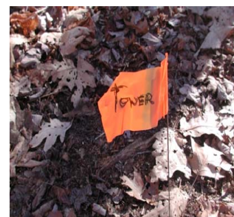
Flag in forest at MLBS marks location of NEON

Construction at MLBS is scheduled to begin in 2012. Mountain Lake Biological Station will be one of the first NEON sites to come on line.