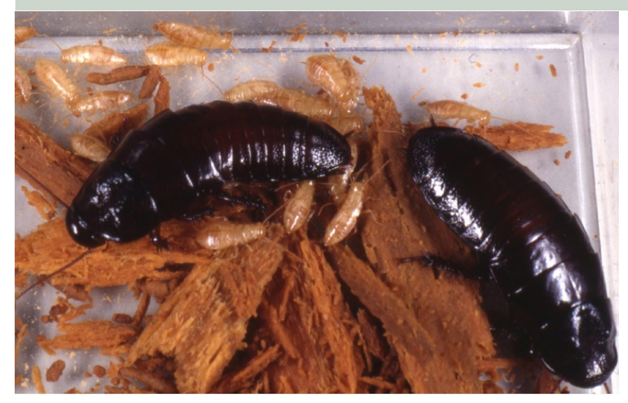
A family group of wood roaches in the decaying wood they occupy.

Occasionally you will see researcher Christine Nalepa lugging heavy boxes into Lewis Hall. What they contain is the subsocial wood feeding cockroach Cryptocercus punctulatus . Wood roaches are the best living model of a termite ancestor, as termites are