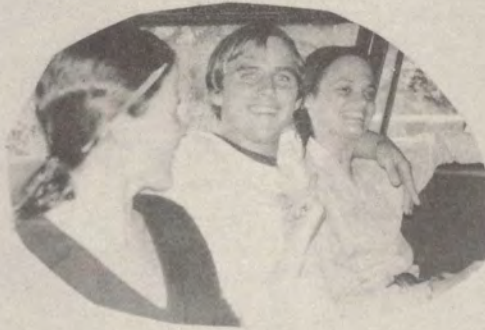
We have long, tiring field trips.