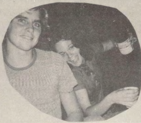
Dear Mom: we work very hard here. I hope I can last the summer.