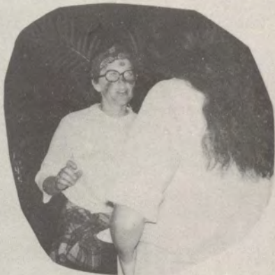
Hello, I live at the Station. Can we be friends?