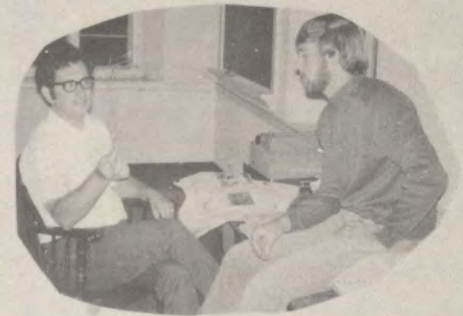
Now Rich, sedges really are interesting...