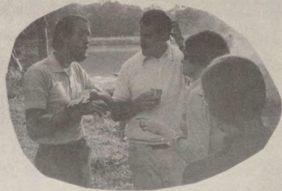
Really, Tom, it's simple. I'll explain again. The rocks alternate with layers of mortar.