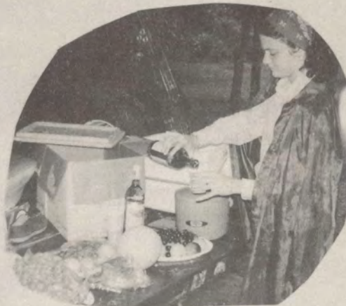
...and the lunches are just awful.